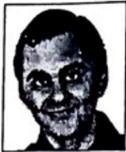
BY MINOO JOKHI