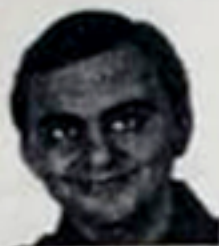
BY MINOO JOKHI

A Mind Map is usually created around a single thought, drawn as an image in the centre of a blank page, to which other associated representations of ideas such as images, words and parts of words are added. It is a useful tool